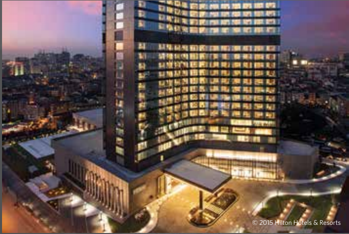
© 2015 Hilton Hotels & Resorts